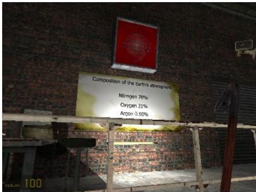
Figure 2. Use of text in DoomEd

Gaming offers a terrific opportunity to develop literacy skills. Because establishing links between the spoken and written word develops literacy, game mechanics should offer both audio and text options. This may be legitimized in the context of the narrative by speech within the game or by artifacts that offer text-based solutions or needed information. In DoomEd , for example, solutions are stuck to walls as part of the backdrop, as old posters or scientist's scribbles on chalkboards (Figure 2); Need for Speed: Most Wanted uses a text and mobile phone metaphor.